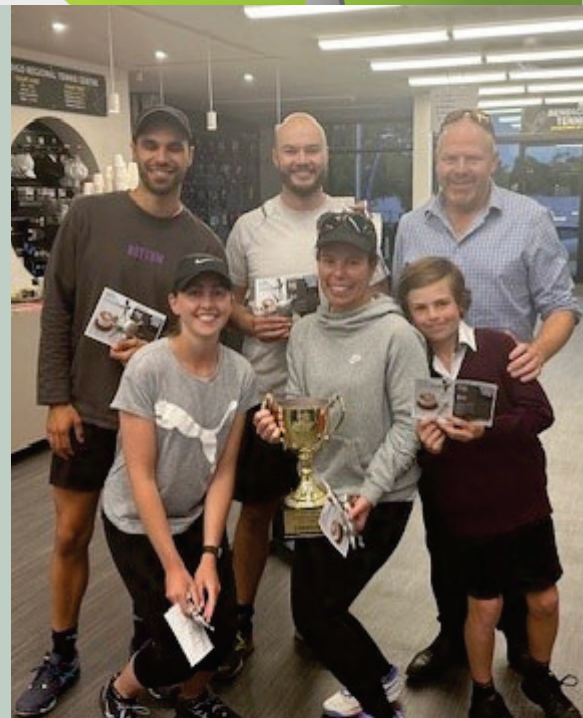
Winners of 2023 Corporate Tennis Challenge: Butterfly Audiology